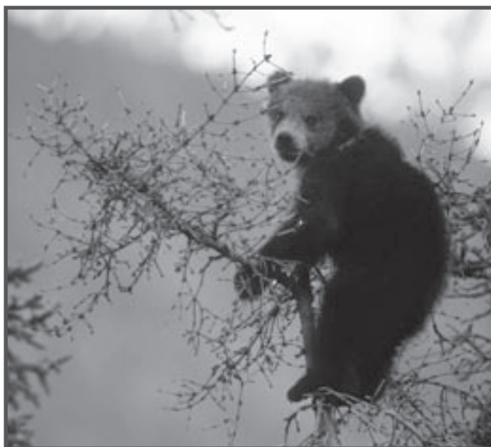
TREED BEAR CUB on the Kenai Peninsula