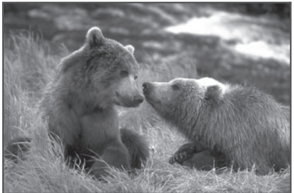
BROWN BEARS on the Kenai Peninsula are a population at risk.