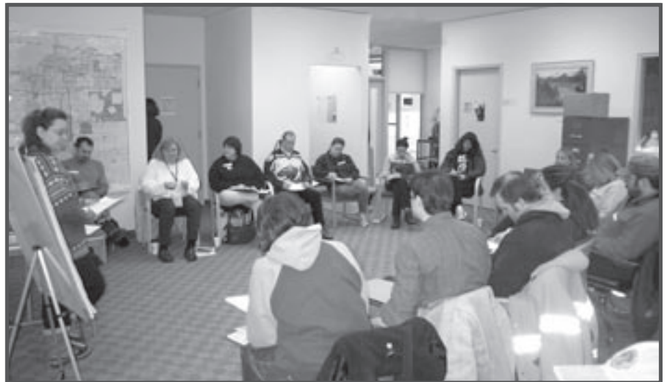
ATTENDANTS AT A VOLUNTEER TRAINING during the legislative session

is a mixed bag for new leases, and does nothing for the areas already leased in the Mat-Su and around Homer. HB 531 failed to ban toxic fracturing fluids from the development process and provided no opportunity for property owners to say "no" to development on their land. The bill does eliminate the flawed shallow gas program, ensuring that future leases include better public notice, a comment period and competitive bidding; a package that current leases missed out on. The