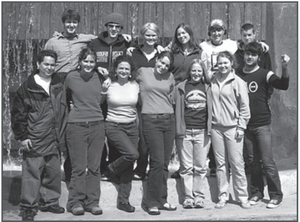
COMING TO A NEIGHBORHOOD NEAR YOU! The 2004 canvass team is wearing out the shoe leather to bring conservation issues - and ways to get involved - to your doorstep.

Celebrating our ninth summer of door-to-door outreach, I'm proud to boast that personal communication is our most effective tool for organizing citizens into a collective voice for conservation. So when you hear that knock at your door, be prepared for an informative discussion and opportunities to take action. Be sure to thank the organizer for their hard work and dedication, and refreshments are always appreciated!