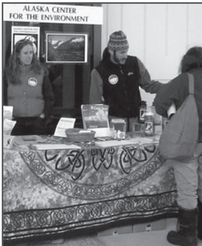
EARTH DAY - ACE volunteers staffing the booth at APU on April 18.