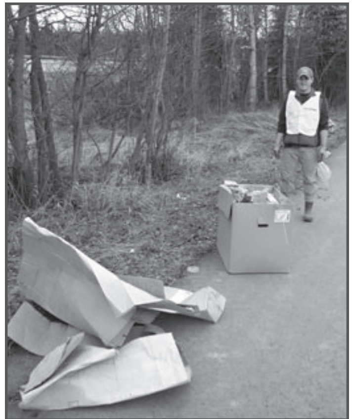
TRAIL CLEANUP - cleaning up the Eagle River bike trail from Eagle River bridge to Peter's Creek.