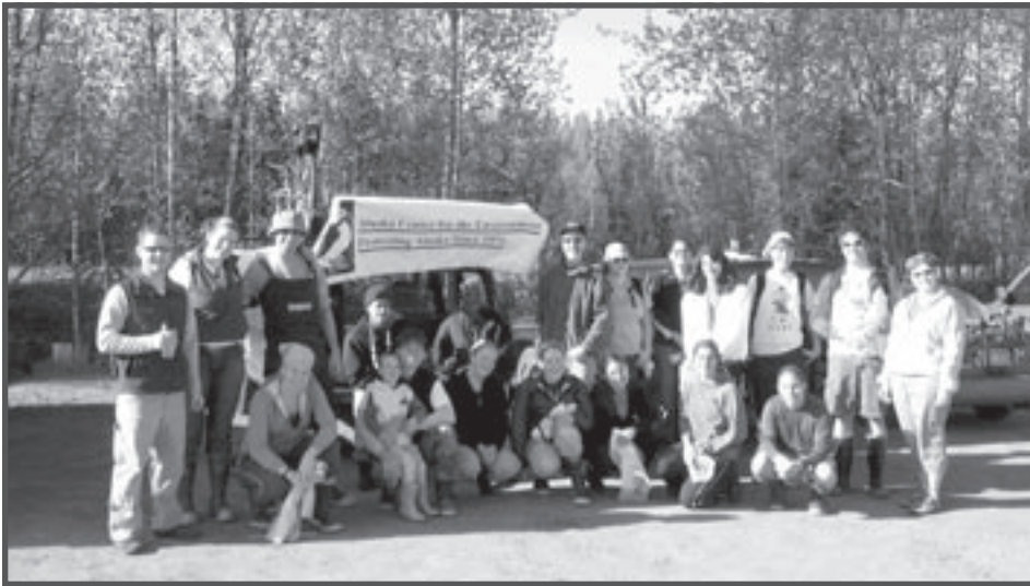
CREEK CLEANUP - ACE volunteers cleaned up Chester Creek near Woodside Park on May 15. ACE's group was awarded the Colossal Creek Cleaners Award for the second year in a row.